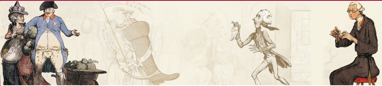
All illustrations reproduced with kind permission of the British Library and the British Museum.

“The content, scope and accessibility of Eighteenth Century Collections Online are astonishing. Enthusiastically recommended for all academic, public and research libraries serving serious literary scholarship.”